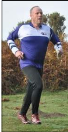
Long sleeve top £31 with rear pocket.