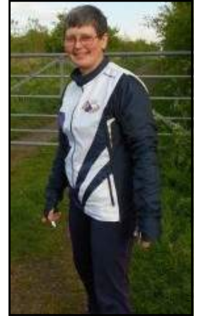
Warm up top £32, Trousers £20.

http://media.wix.com/ugd/c6b803_1ade477dfbaf4217b184c202de1911b9.pdf for a sizing guide the for top three items.