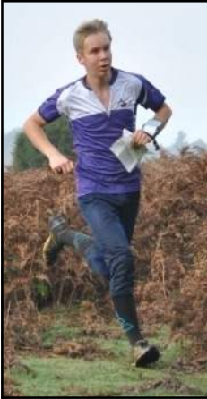
Short sleeve top £23, or £21 with no rear pocket.