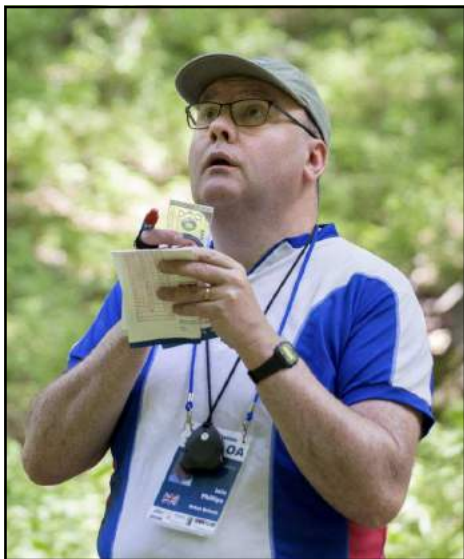
European Trail O championships, Slovakia