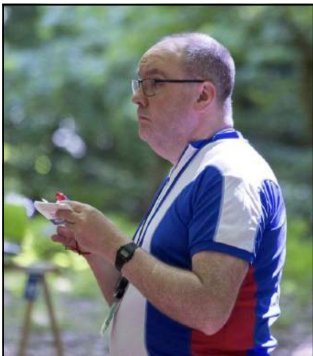
European Trail O championships, Slovakia

knowledge as much as being coached and taking part in events. So the majority of my training this spring has come from planning the Irchester Middle Distance event and the TempO at the JK.