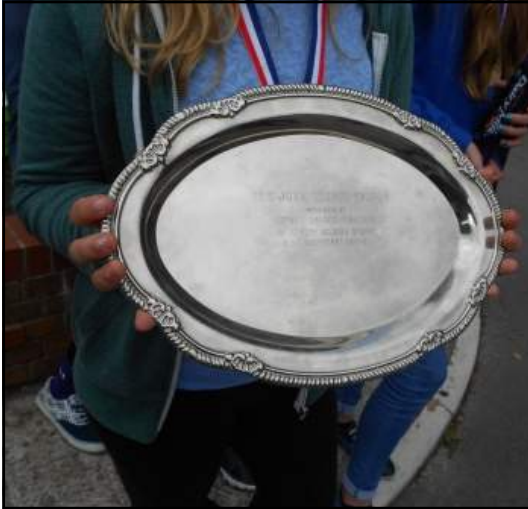
The Joan George Trophy.