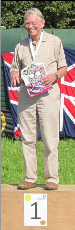
British Middle Distance Championships, 2014, M80 class, 1st Place: