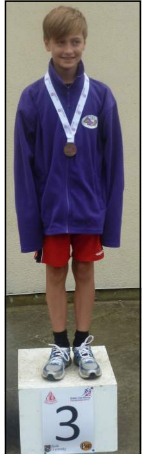
British Sprint Championships 2014, M10 class, 3rd Place: