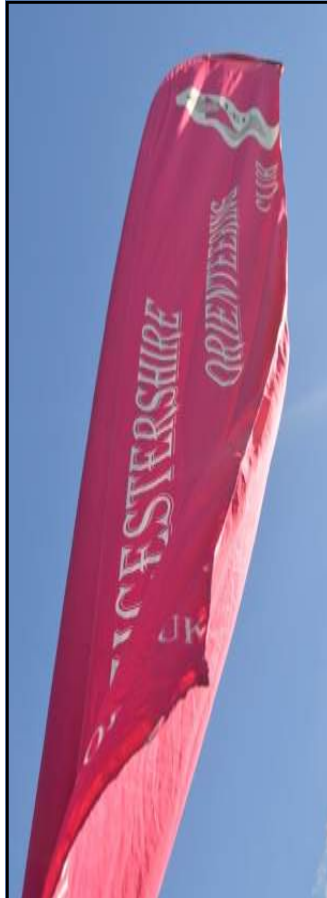
LEI Feather Flag.