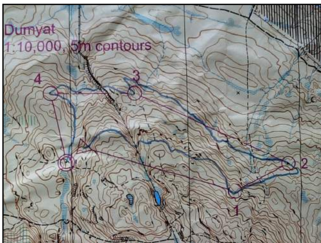
Above is an example of the types of areas we had to train on. (This is Dumyat - Wednesday). The (editor:curved) blue line is the route that I took, which I drew on afterwards, as part of my post-race analysis.