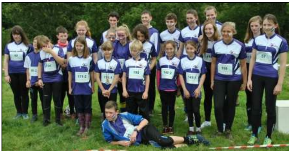
The majority of the LEI Yvette Baker Trophy Team